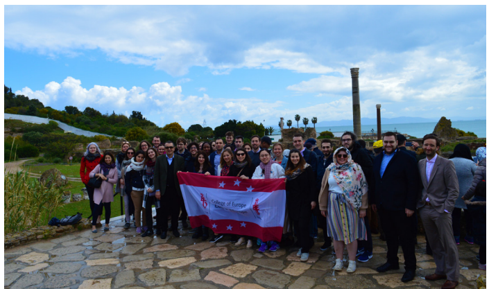
On the left: second semester study trip to Tunisia. On the top: first semester study trip to Ukraine

We believe that Europe must be learned and understood on the field. Our study trips are designed to provide students with information, encounters, lectures and other academic experiences that cannot be delivered on the campus. In this respect, they represent an irreplaceable added value to the academic programme.